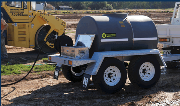
DIESEL TANK UNITS

This Summer take the Diesel where it is needed when it is needed